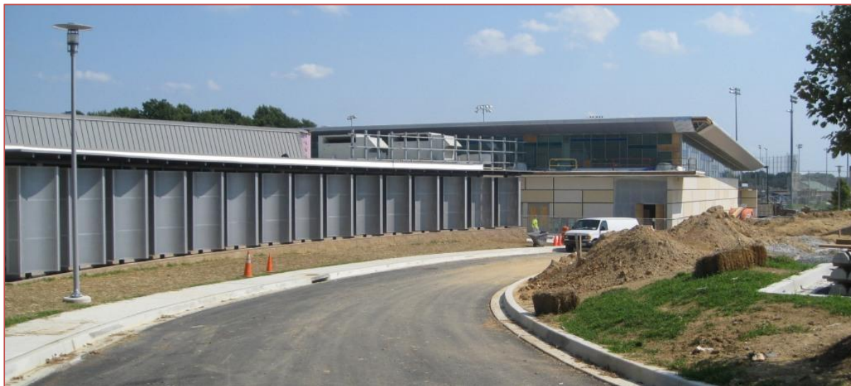
Figure 1: The facade's canopy of the Susquehanna Center is shown at the left, and the basketball arena addition is shown at the right. The photo was taken during construction in early September.

Figure 1 shows a view of both the renovation and addition parts of the project. The canopy of the façade is shown at the left and it extends till it reaches the basketball arena addition at the right, which has a greater height. The photo was taken during construction in early September.